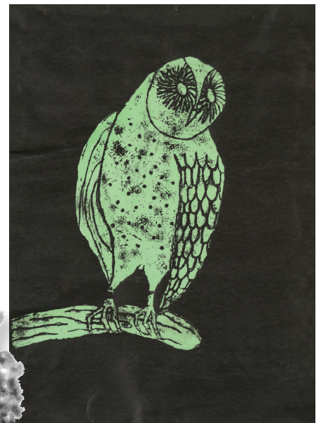
above Natasha Craig, Owl , 2014, styrofoam print, 42 x 30 cm.